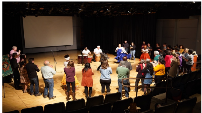
RicanStruction at the RCAH Theater