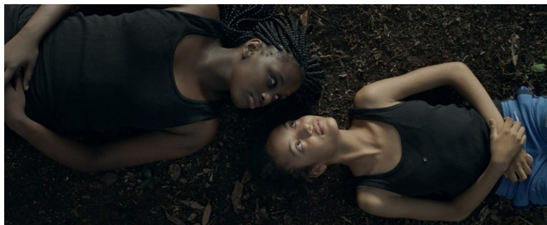
Ceniza Negra / Land of Ashes (Costa Rica)

As always, this was accomplished through programming that has wide appeal and is particularly relevant to the needs, concerns and interests of the campus and the regional Latinx communities. In order to expand our audience, LxFF 2020 featured an array of genres and new media, including several social dramas and documentaries, thrillers, comedy, and even a family adventure film, as well as virtual reality and 360° video. Countries represented included: Argentina/Uruguay, Brazil, Chile, Colombia, Costa Rica, Cuba, Panama, Paraguay, Peru, and multiple films from the United States, including Puerto Rico and several films dealing with immigration from Mexico and Central America, as well as Chicano culture and history rooted in California, Illinois and Texas. Once again, LxFF 2020 notably showcased women directors as a result of an ongoing commitment to gender equity that guides our programming decisions. It also continued to highlight Afro-Latinx culture. In addition, LxFF 2020 had a special focus on indigenous cultures and languages, featuring several films shot partially or entirely in indigenous languages such as Quechua and Wayuu.