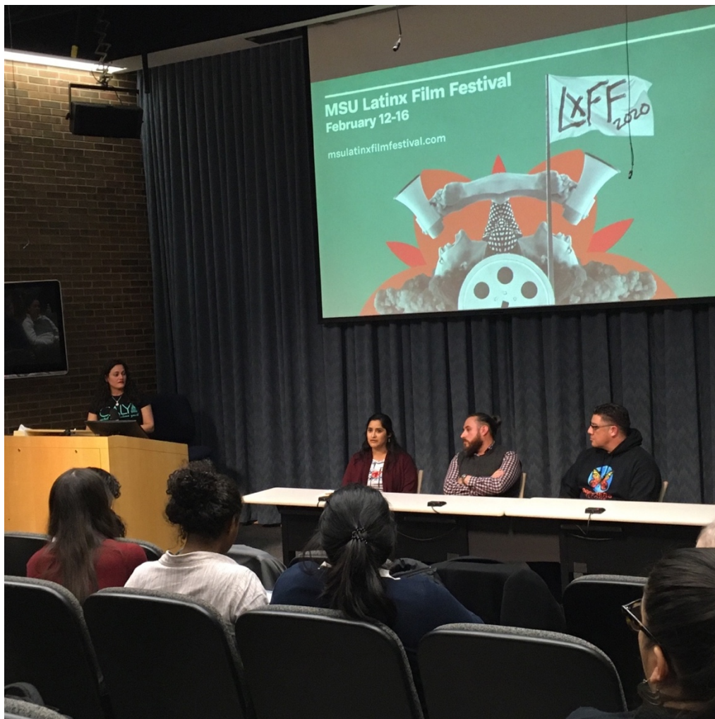
Panel discussion of The Pushouts , the LxFF 2020 opening night film, at WKAR Studios

In order to plan, promote and produce such a large festival run entirely by voluntary staff it was necessary to increase the size of the organization. While the inaugural edition of LxFF was organized by a small group of six members of the Spanish section of MSU's Department of Romance & Classical Studies (two faculty members and four graduate students), LxFF 2020 had a more complex organizational structure that involved people from different units across campus, as well as key community leaders drawn from the greater Lansing Latinx community.