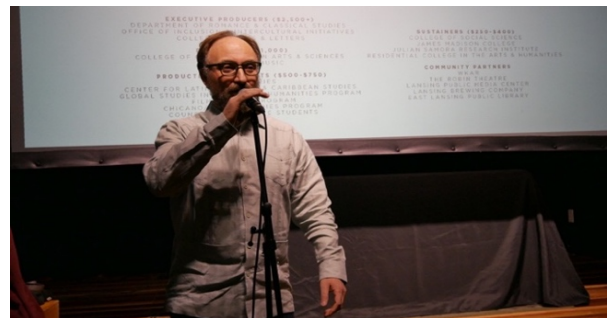
Miguel Cabañas presents Ruben Blades ... (Panama)