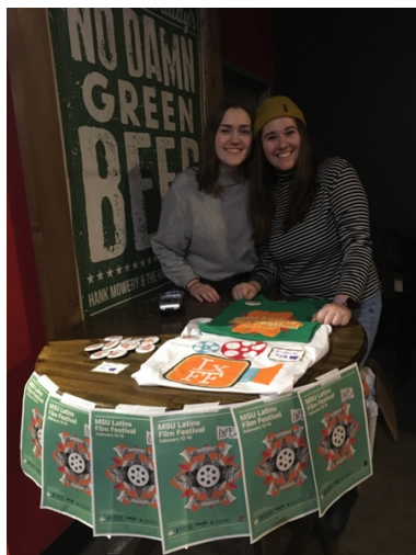
Volunteers with LxFF merch