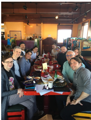
LxFF 2020 closing day lunch