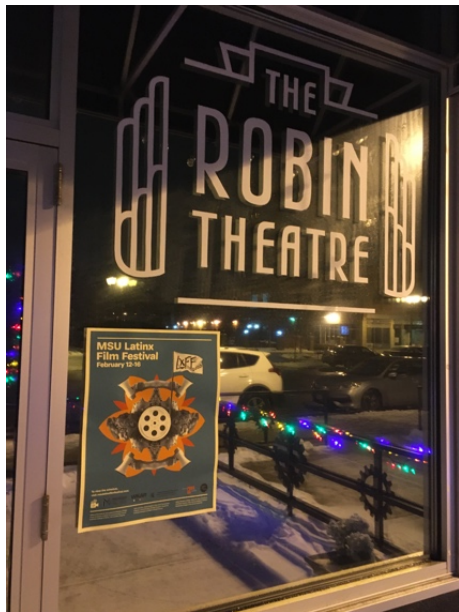
LxFF's first community partner