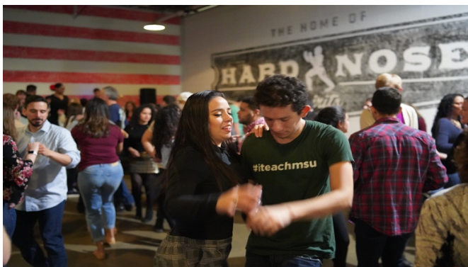
Dancing to Salsa Verde! at the Lansing Brewing Co.