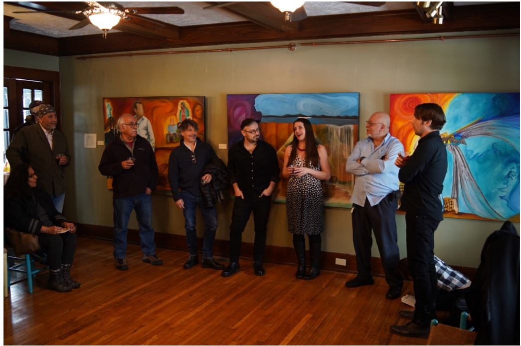
Meet & Greet with Invited Guests & Featured Local Latinx Directors at Casa de Rosado

As always, this was accomplished through programming that has wide appeal and is particularly relevant to the needs, concerns and interests of the campus and the regional Latinx communities. In order to expand our audience, LxFF 2020 featured an array of genres and new media, including several social dramas and documentaries, thrillers, comedy, and even a family adventure film, as well as virtual reality and 360° video. Countries represented included: Argentina/Uruguay, Brazil, Chile, Colombia, Costa Rica, Cuba, Panama, Paraguay, Peru, and multiple films from the United States, including Puerto Rico and several films dealing with immigration from Mexico and Central America, as well as Chicano culture and history rooted in California, Illinois and Texas. Once again, LxFF 2020 notably showcased women directors as a result of an ongoing commitment to gender equity that guides our programming decisions. It also continued to highlight Afro-Latinx culture. In addition, LxFF 2020 had a special focus on indigenous cultures and languages, featuring several films shot partially or entirely in indigenous languages such as Quechua and Wayuu.