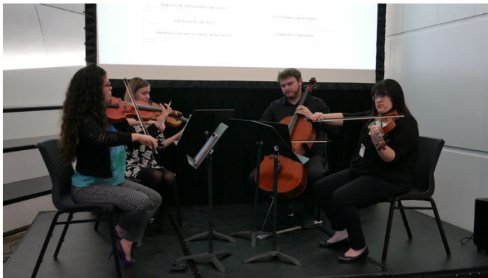
College of Music String Quartet at the Broad Museum

Music, one of the essential elements of LxFF programming, featured prominently in the lineup, with two music documentaries exploring the intersection of music, politics and culture, including the closing film, Singing Our Way To Freedom , presented by invited director Paul Espinosa. Those films were complemented by the addition of live music through a new collaboration with the MSU College of Music, which resulted in the elegant opening reception performance of classical Latin American composers by the MSU College of Music String Quartet, as well as the energetic Salsa Verde! concert held Saturday night at the Lansing Brewing Co. to a packed house. In addition, LxFF hosted the legendary Detroit-based musician/educator/activist Ozzie Rivera, who participated in various aspects of the festival, including an interactive, community-building performance of his Afro-Puerto Rican band, RicanStruction.